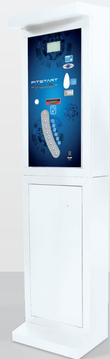
Pit Start Plus

Designed for maximum performance and extreme reliability